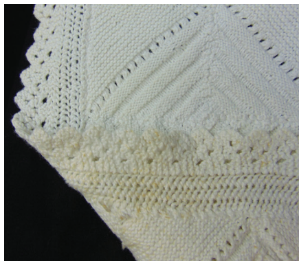
A portion of the original heirloom crib blanket folded to show both front and back as well as the edging.