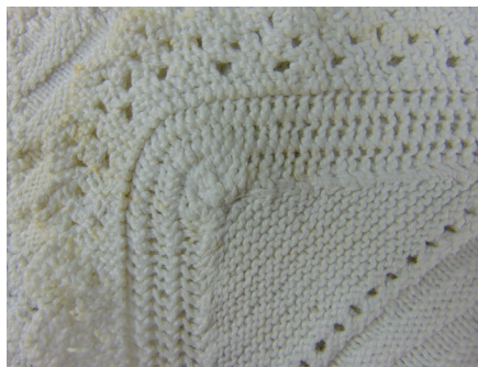
The top left corner of the crib blanket. The edging was knit separately and then sewn to the assembled blocks.