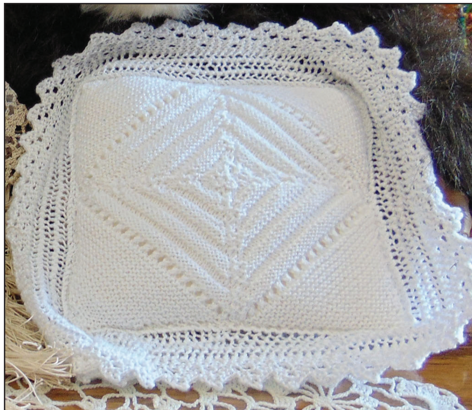
A knit counterpane pincushion inspired by the pattern of an heirloom counterpane crib blanket in the collection of the Huron County Museum & Historic Gaol located in Goderich, Ontario.

FINISHED SIZE 6 inches (15.2 cm) square, excluding edging.