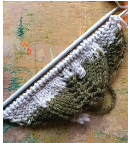
Above, the second colour is being worked in. This is a good pattern to use up bits of leftover yarn you may have in your stash.