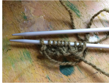
Above, the counterpane square begins with the leaf.

33rd Row: Yo, p16, k3tog, p16 (top of the leaf)