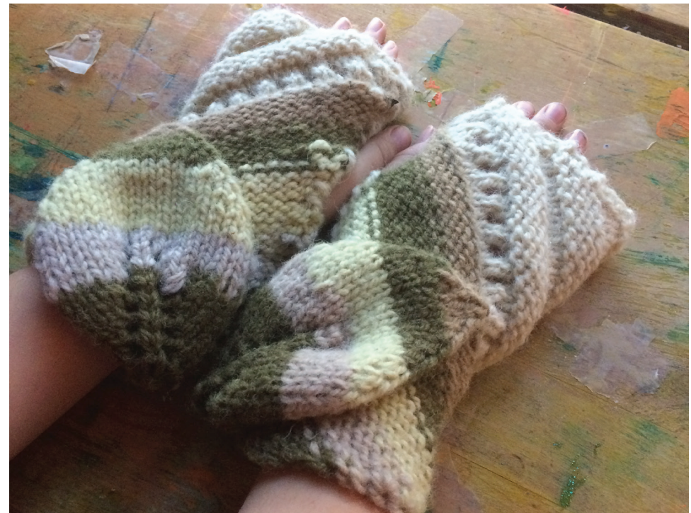
The leaves, colour banding and eyelet rows align nicely on these counterpane inspired fingerless mitts. Above, the mitts are modeled by the designer's daughter.