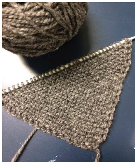
Above, the Ridges & Eyelet square has been knit to the mid-point, almost ready to start the eyelet row.