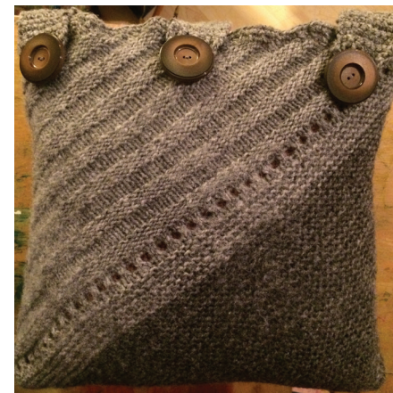
The reverse of the pillow: one counterpane square knit until it measures 14" square (72 stitches at its widest) and then finished with small straps & buttons.